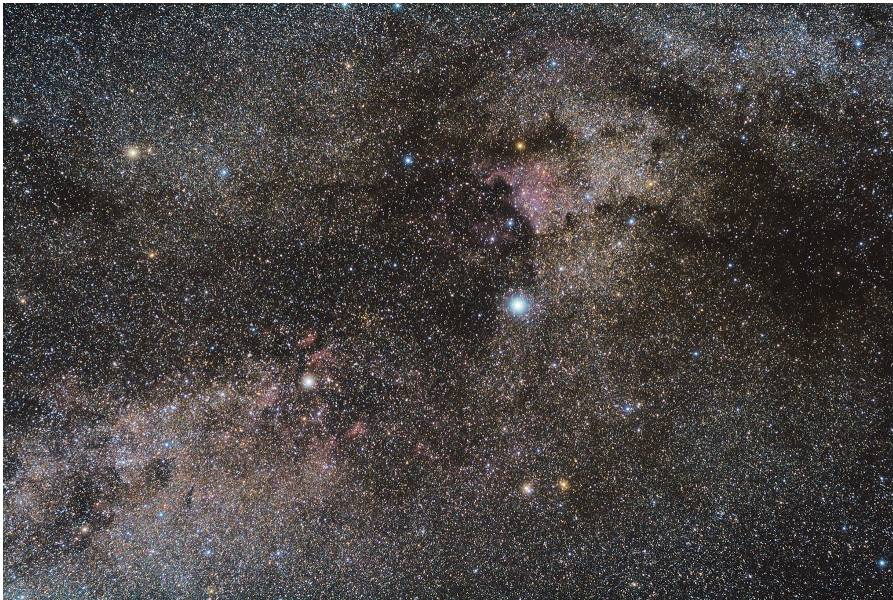
Long exposure shot of Deneb (brightest star, near center) in its richly populated Milky Way neighborhood. Source: https://www.flickr.com/photos/jpstanley/1562619922 License: https://creativecommons.org/licenses/by-nc-sa/2.0