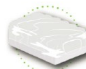
Wood pellet bags