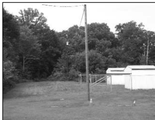
By clearing out the field behind the observatories, more parking has been opened up.

Bond also created a temporary display featuring two chart recorders that had been used by Penzias and Wilson on loan from AAI.