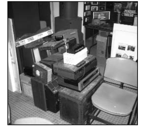
Some of the piles of stuff that needed to be sorted as part of the cleaning efforts.