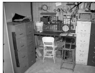
You can see the floor! The work-room looks very neat.